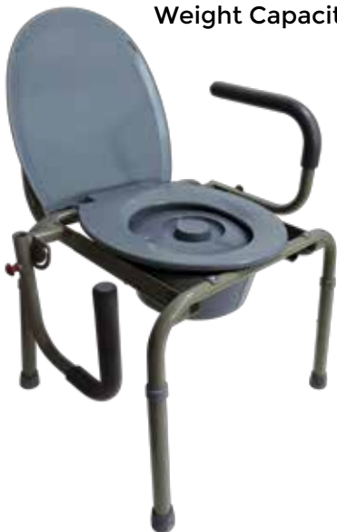
Bucket & Lid